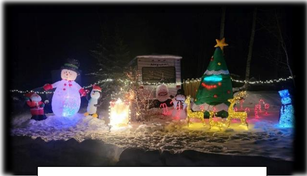
Winter Wonderland 2022